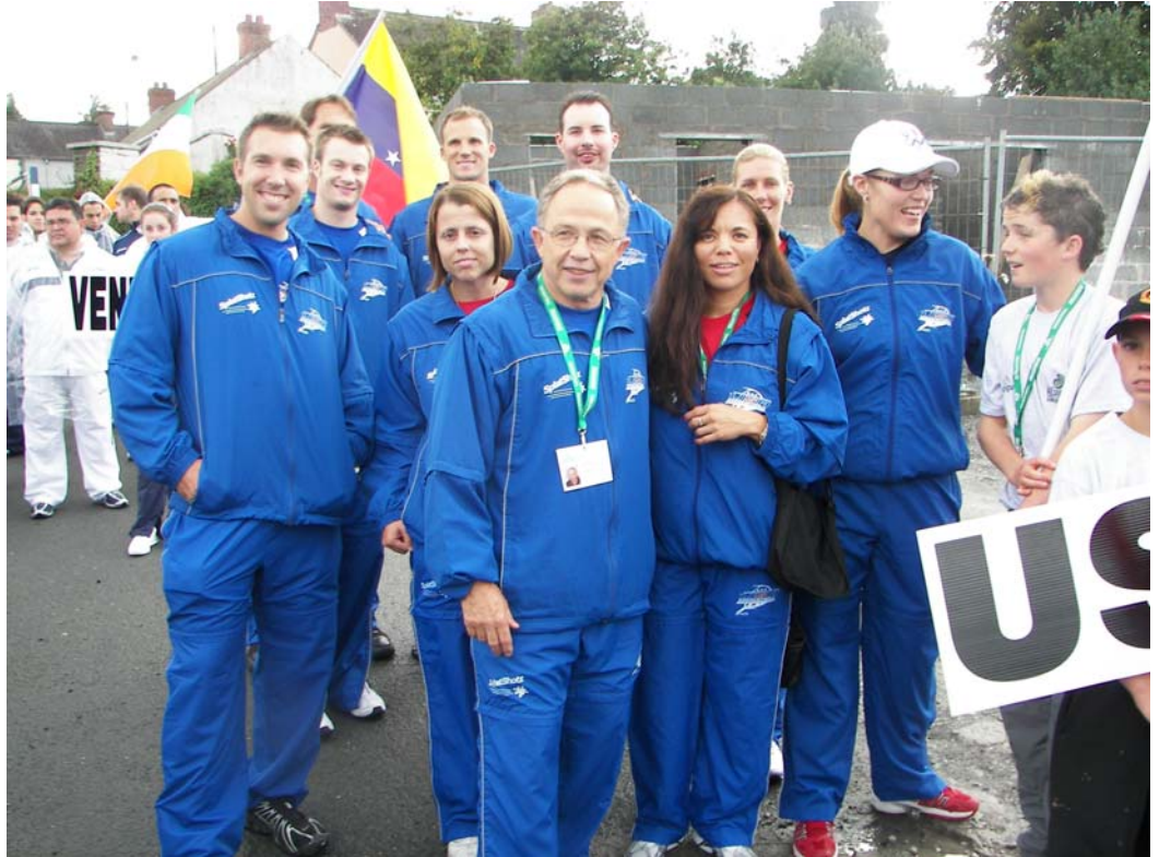
Team USA prepares for the Opening Ceremonies

The opening ceremonies of the 14th International Racquetball Federation 2008 World Championships were a unique event in the history of the competition. It was the first time the event was held in Ireland and preparations by the Kingscourt Handball and Racquetball Club and the Kingscourt Community Council were ongoing for more than a year. The Championships got under way with a parade of the various countries headed by the Kingscourt Brass and Reed Band followed by flag bearers representing each country. Many of the world's top racquetball players from Argentina, Belgium, Brazil, Bolivia, Canada, Catalonia, Chile, Chinese Taipei, Colombia, Costa Rica, Dominican Republic, Ecuador, Germany, Guatemala, Holland, Honduras, India, Ireland, Italy, Japan, Korea, Mexico, Netherlands, Poland, Scotland, Turkey, United States of America, and Venezuela competed on Kingscourt's five courts. The 153 competitors vied for gold medals in multiple divisions and were delighted with the facilities as well as the warm welcome they received from the people of the Kingscourt area. The ten-day championship was the biggest international event ever held in the town.